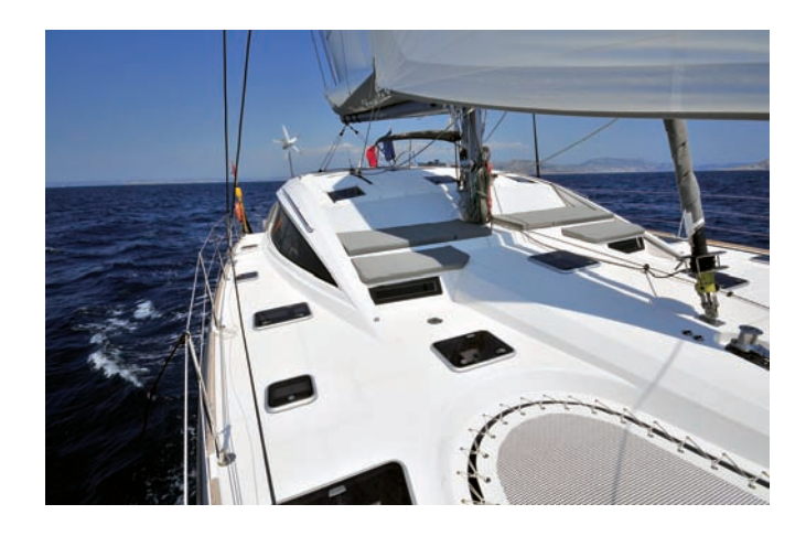
Having a cutter rig is made easier by the superstructure. The front of the S5 also benefits from an appreciable sunbathing area