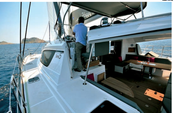
At deck level or from the cockpit, the access is good and safe

The new cockpit design works well. Conviviality, safety of the dinghy on its own specific platform, and a special mention for the handrail and threelevel guardwires