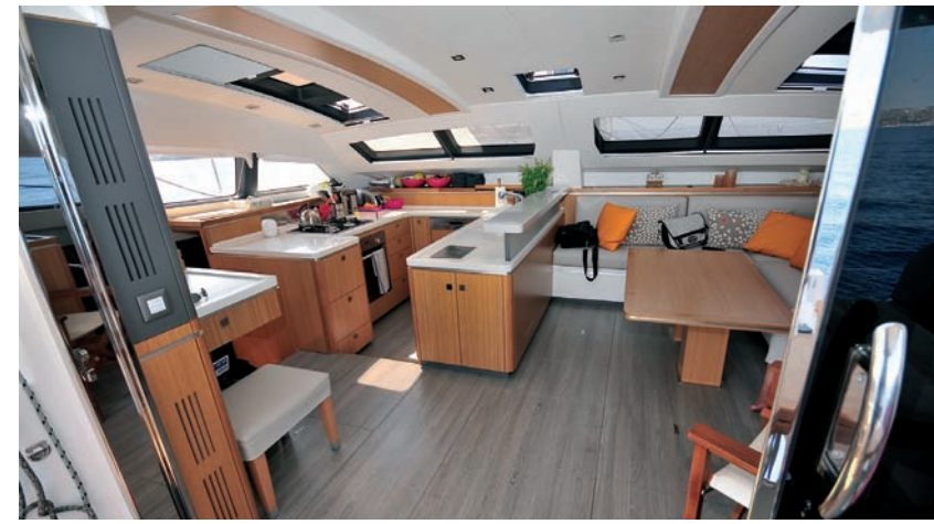
The splendid sliding door in stainless steel provides access to the new design, and to the discovery of Privilège quality

Despite the unfortunate increase in maintenance needed by having saildrive transmission, the engine compartments are well designed, painted throughout, light and accessed by metal ladders. The strong, watertight hatches are located in the deck and not on the aft steps. The motors have been moved forward in the boat, creating space for the generator (to starboard) and the watermaker to port. The anchoring station