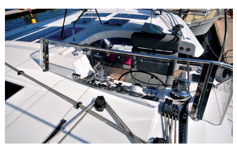
The helm station is the nerve center of the boat, its design and construction largely participating in the sense of controlling the boat

The S5 already has the complete cockpit layout which was standard on the 515. Welcome additions are the handrails and guardwires making it safe all the way aft, as well as the design of the davit system. Only used for raising and lowering the dinghy (stowed in a cradle on a dedicated platform). This pertinent arrangement relieves the arms from permanently carrying the full weight of the tender and outboard. The new sugar-scoop design simplifies access to the water for swimming or embarking or disembarking to or from the dock or the dinghy. The bimini has two large opening panels, which allow for a good view of the mainsail. Another good point is the folding table/bar: located to starboard near the sunbathing area, it can seat 8 people in addition to the little corner unit to port with removable table. A large bench seat aft completes this chic and practical relaxation area. The grip of the slatted teak deck adds a touch of luxury.